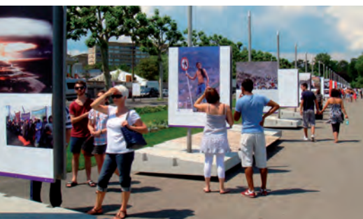
IPB's exhibition "Making peace" in Geneva (2010), to mark the centenary of its award of the Nobel Peace Prize.

We founded the Week of Prayer for World Peace (October each year), and continue to have close ties with it.