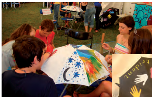
Art work in the NCPO Peace Zone at the annual Greenbelt Festival