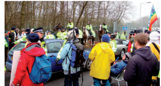
Blockade of one of the gates at The Atomic Weapon's Establishment, Aldermaston in March 2010.